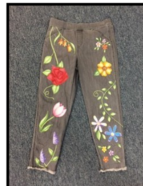
The students and their projects.