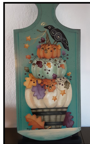
Hipster Denim Garden, left, and Pumpkin Topiary, right.

Kaye for more information on the tray.) This might also look cute on a round bucket or flat front basket; or split up the pattern for a two-sided piece. Paint and supply list is also available below.