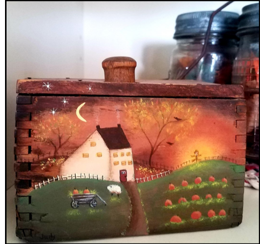
Above & Below: Samples of Judy's work.

A. I really want to paint a lot of those projects I didn't have time for when my children were little, including a collection of nativities of all types and designs.