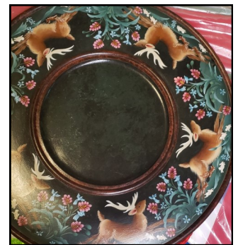
Woodland animal plate.