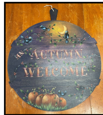
Oct. 8 Workshop