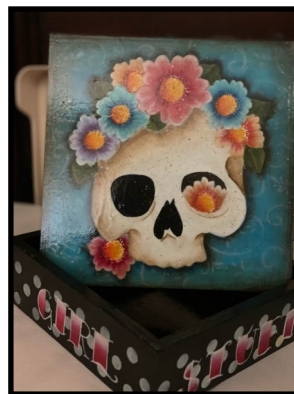
Sept. 10 Paint-In