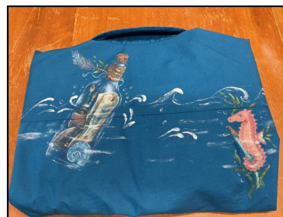
Nov. 12 Paint-In